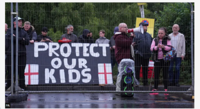
Protesters gathered near The Bell Hotel in Epping while the council met

Council votes to urge government to shut asylum hotel