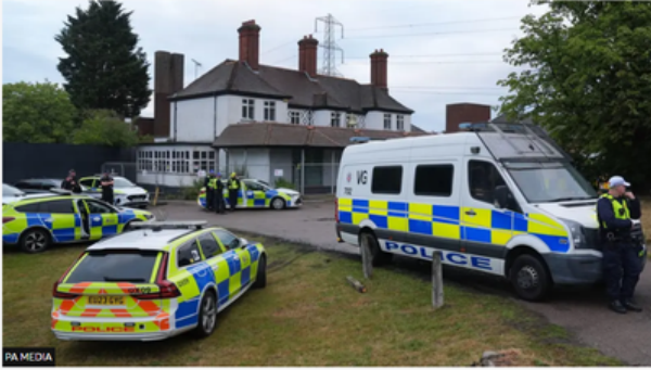
Police have been guarding The Bell Hotel in Epping since demonstrations began

Protests leave asylum seekers afraid to exit hotel