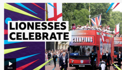
England celebrate Euro 2025 triumph with fans in central London July 2025

Euro 2025 winners England to play China at Wembley